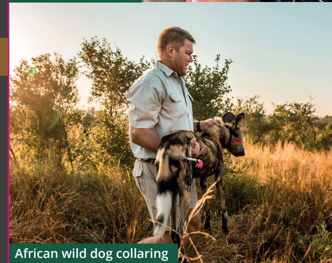
African wild dog collaring